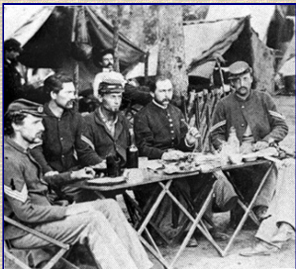
(above) Non-commissioned officers Company D, 93rd New York Infantry.

The military authorities' attitude toward what the men ate and how they prepared it was largely a reflection of the time in which they lived. Soldiers dined on much the same raw materials as they had when at home on their farms. Meat was the staple of almost every diet, and they ate it either freshly killed, or preserved by a variety of means from pickling in brine, to smoked, dried, sugar-cured, and even canned in tins. Vegetables (carrots, onions and potatoes) and fruit (apples, pears, plums, cherries, peaches) were the other mainstays, eaten fresh when available, or else dried.