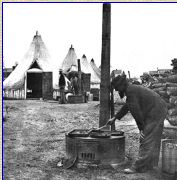
(right) Well-equipped regiments had a number of camp stoves for the use of the soldiers, but these were often little more than an iron box with a stove pipe.

Recent technological developments made it possible by 1860 for some of these regional specialties to be enjoyed elsewhere. Smoking, pickling, and drying were preservation techniques older than human memory. But within this century men had discovered the art of vacuum packing meats and vegetables in tin cans (Hormel - tinned meats), glass jars (Ball Mason jars - canning vegetables), and Gail Borden had recently developed a process for "condensing" milk, putting it into tins that could keep it for months ( a product available to us to this day).